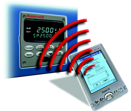
Infrared PC and Pocket PC configuration