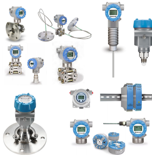
Honeywell SmartLine Product Lineup:

Smartline pressure, temperature, level and multivariable transmitters feature industry-leading performance, unique features that lower total cost of ownership and Smart Connection suite for the best control system integration. They help users to monitor and protect asset health, comply with environmental regulations, reduce energy waste and improve throughput and safety.